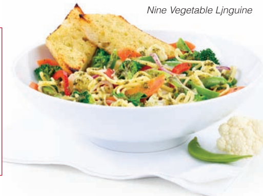
Nine Vegetable Linguine

A rich beef short rib and veal bolognese sauce, topped with grated Parmesan cheese. Served with garlic bread. $14.99