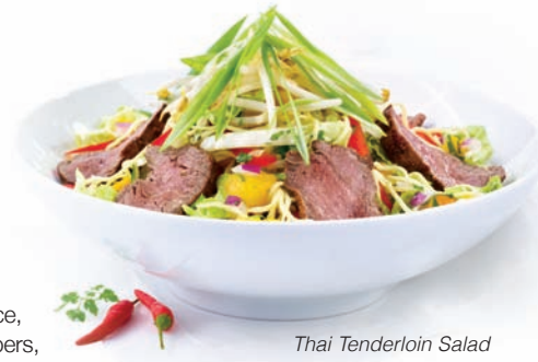
Thai Tenderloin Salad