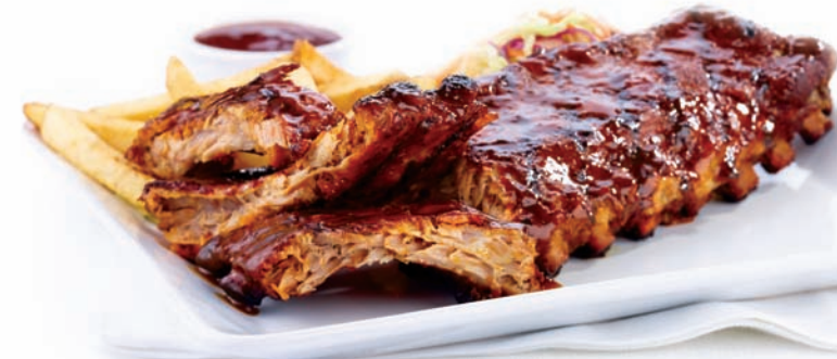
Casey's Famous Back Ribs

Buffalo – Coated in your choice of mild, medium or hot wing sauce. Served with fries, carrots and celery sticks, slaw and Blue cheese dip. $13.99