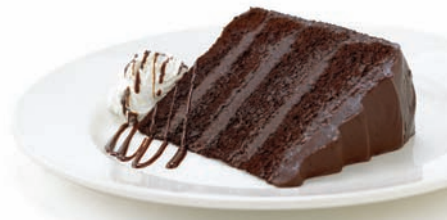
Mile High Chocolate Cake

Layer upon layer of moist chocolate cake with chocolate icing. It's a chocoholic's dream. $7.99